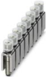
螺钉式桥接件，带弹簧垫圈和绝缘套管，针距: 6.2 mm，宽度: 6.2 mm，位数: 10，颜色: 银色

Please be informed that the data shown in this PDF Document is generated from our Online Catalog. Please find the complete data in the user's documentation. Our General Terms of Use for Downloads are valid ( http://download.phoenixcontact.com )