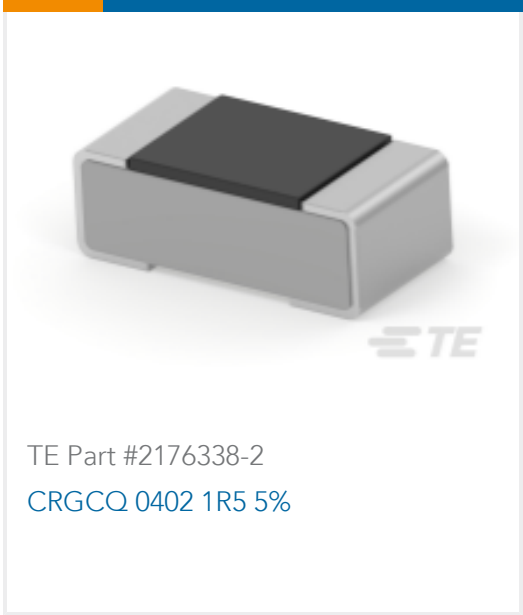
TE Part #2176338-2 CRGCQ 0402 1R5 5%