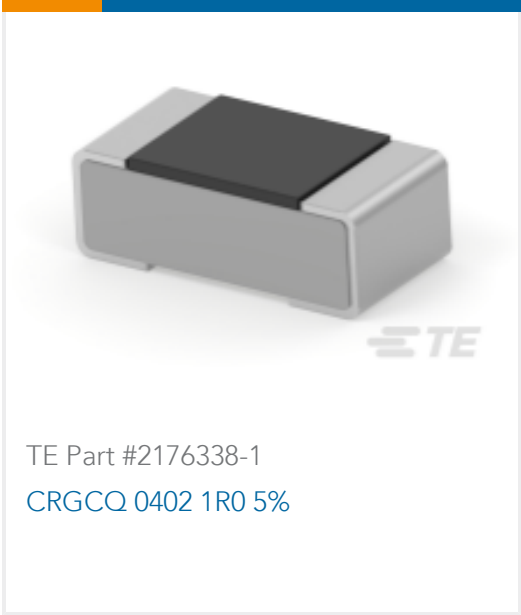
TE Part #2176338-1 CRGCQ 0402 1R0 5%