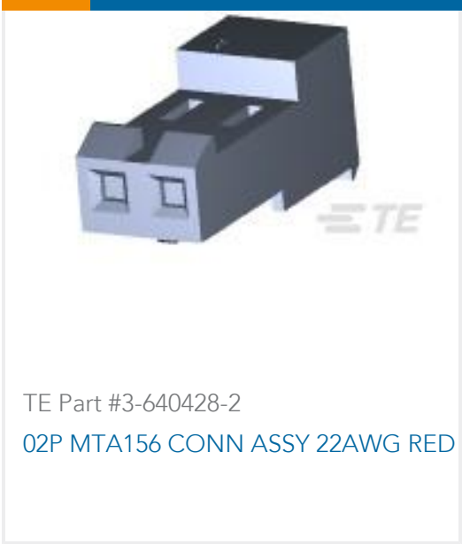
TE Part #3-640428-2 02P MTA156 CONN ASSY 22AWG RED