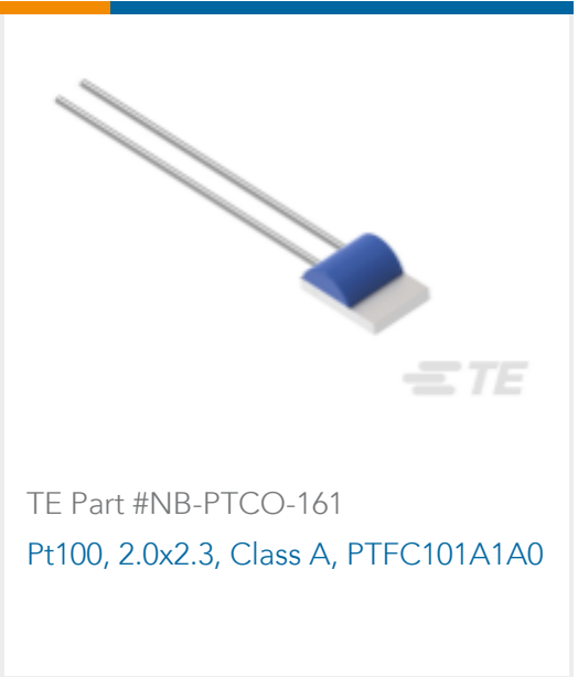
TE Part #NB-PTCO-161 Pt100, 2.0x2.3, Class A, PTFE101A1A0