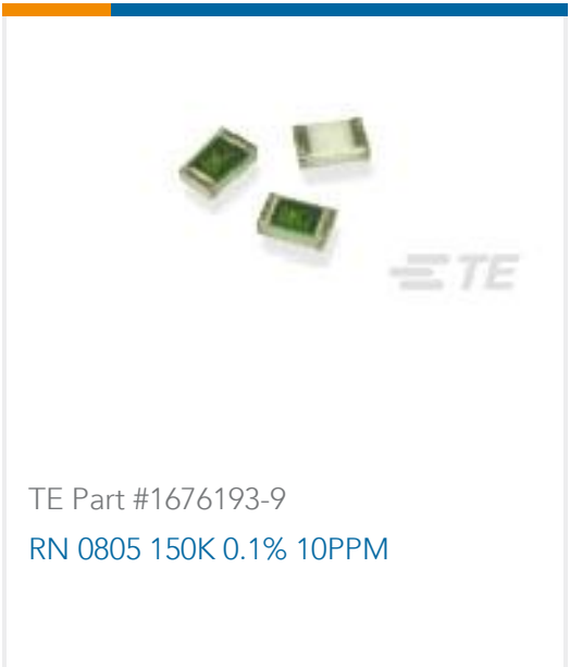
TE Part #1676193-9 RN 0805 150K 0.1% 10PPM

Product Drawings M8 x 1.0 straight plug Pigtail English