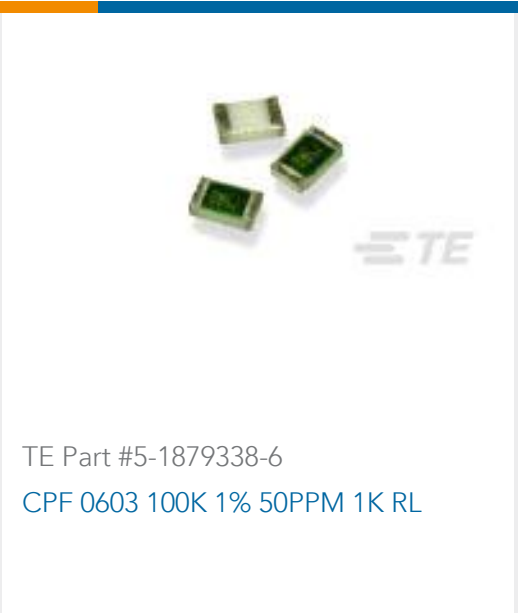
TE Part #5-1879338-6 CPF 0603 100K 1% 50PPM 1K RL