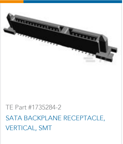
TE Part #1735284-2 SATA BACKPLANE RECEPTACLE, VERTICAL, SMT