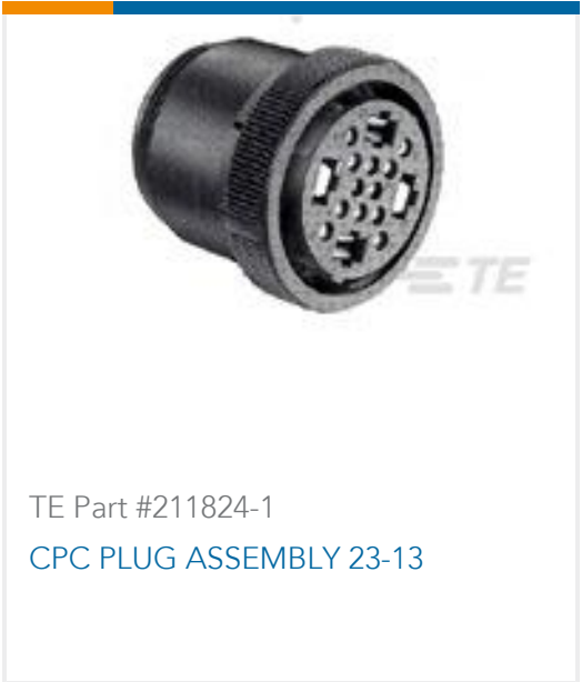
TE Part #211824-1 CPC PLUG ASSEMBLY 23-13