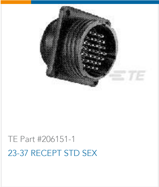
TE Part #206151-1 23-37 RECEPT STD SEX