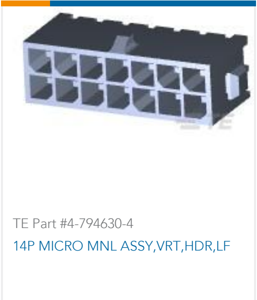
TE Part #4-794630-4 14P MICRO MNL ASSY,VRT,HDR,LF