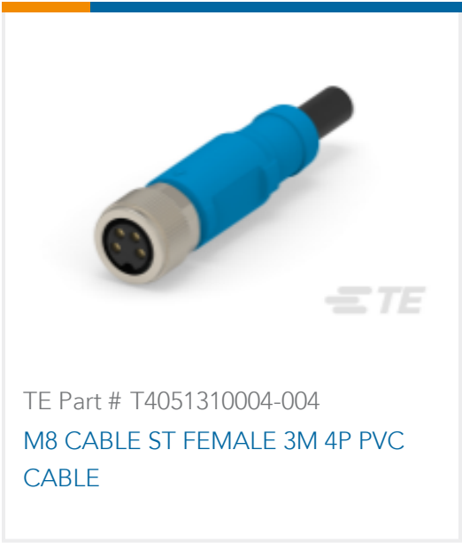
TE Part # T4051310004-004 M8 CABLE ST FEMALE 3M 4P PVC CABLE