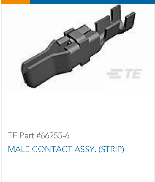
TE Part #66255-6 MALE CONTACT ASSY. (STRIP)