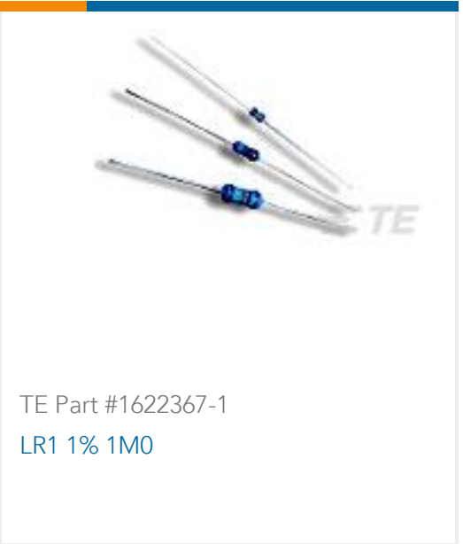
TE Part #1622367-1 LR1 1% 1M0