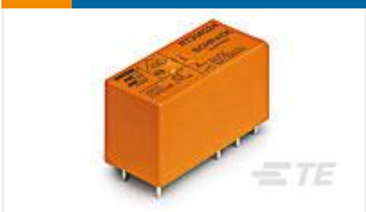
TE Part #8-1393243-5 RT425024