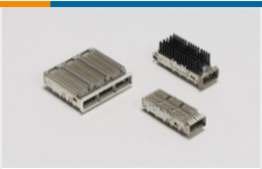
QSFP, QSFP+ & zQSFP+(425)