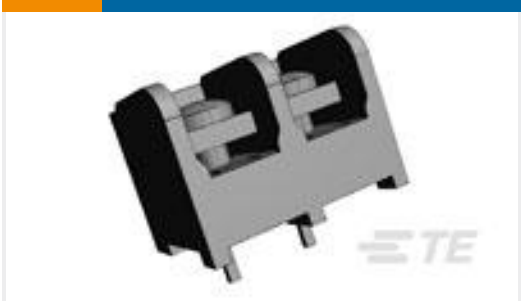
TE Part #3-1437652-9 6PCV-02-006=6PCV ASSEMBLY