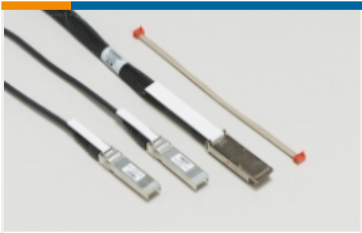
Pluggable I/O Cable Assemblies(81)