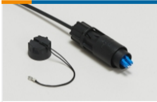
Rugged Fiber Cable Assemblies(20)