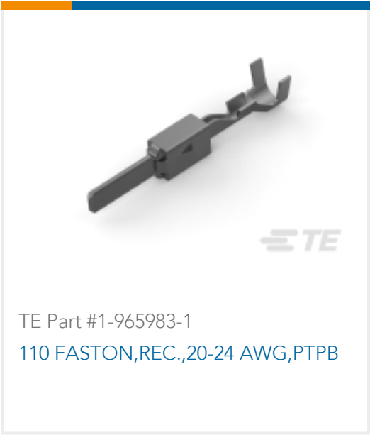
TE Part #1-965983-1 110 FASTON,REC.,20-24 AWG,PTPB