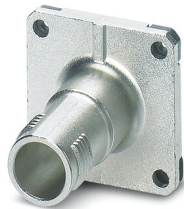
Housing screw connection, Front mounting, square flange 25 mm side length, Square flange

https://www.phoenixcontact.com/us/products/1424131