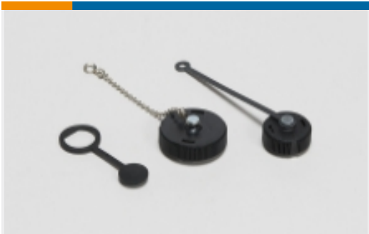
Circular Connector Caps & Covers(2)