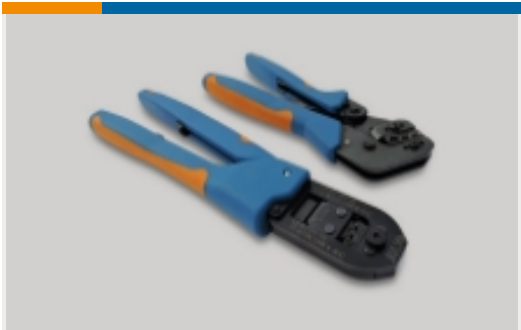
Hand Crimping Tools(32)