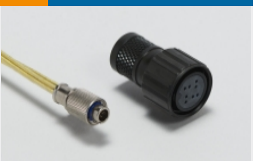
Standard Circular Connectors(2)

Product Drawings M12 FEMALE CONN. , R/A, PVC CABLE English