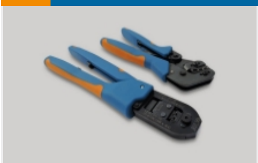
Hand Crimping Tools(32)