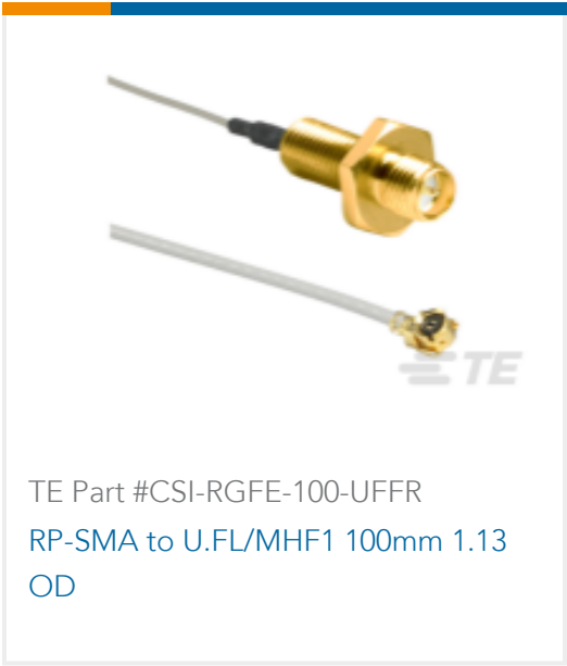
TE Part #CSI-RGFE-100-UFFR RP-SMA to U.FL/MHF1 100mm 1.13 OD