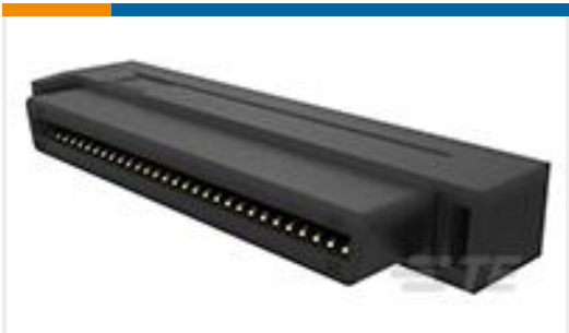
TE Part #1734098-4 Champ050 40p A/P RCPT 25CL PB