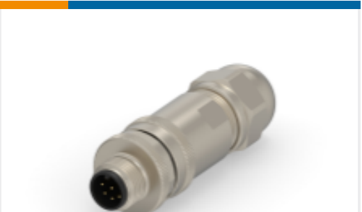
TE Part #T4111012081-000 M12 M, 8P GOLD A_CODE S SHIELDED PG9