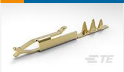
TE Part #1-487547-1 FFC,RCPT CONTACT,.050" CNTRLIN