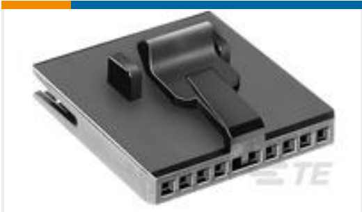
TE Part #1-487545-7 020 HOUSING FFC RCPT 050CL SR