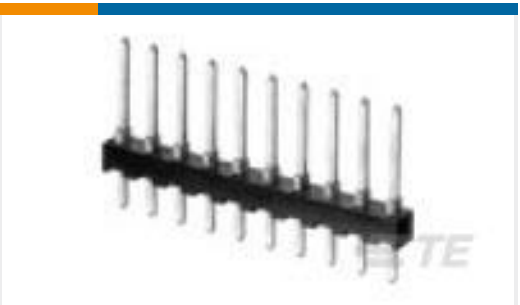
TE Part #87220-8 08 MODII HDR SRST UNSHRD .100