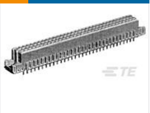
TE Part #5535043-4 ASSY,RECEPTACLE,EUROCARD,TYPE