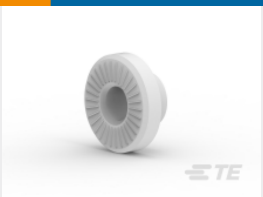
TE Part #T0930050457-000 FLOATING WASHER