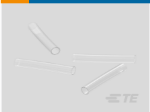
TE Part #NB16702001 RW-175-3/8-X-STK