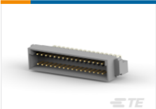
TE Part #5650946-5 ASSY,PIN,EUROCARD,TYPE C/2,LEA