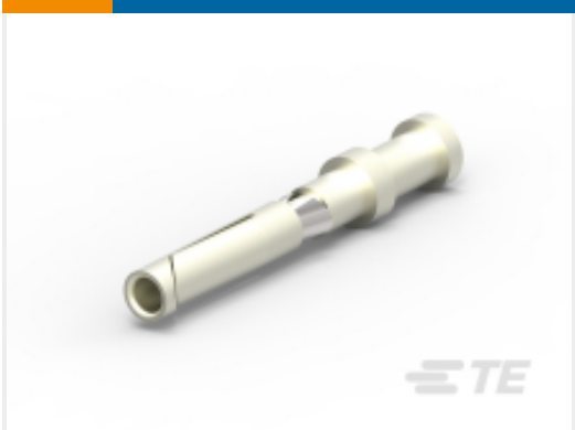
TE Part #T2020002002-000 CDF-0.3