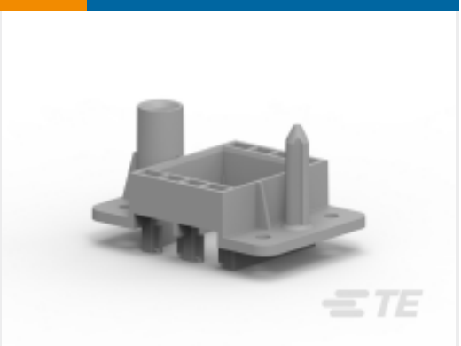
TE Part #T2071064201-000 H6BP-T2-F DOCKING FRAME_FIXED