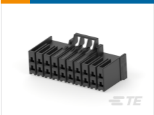
TE Part #175362-1 Receptacle and Tab Housing: 5.08 mm pitch, 600V