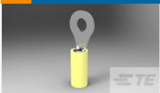
TE Part #53073 TERMINAL,PIDG R 26-24 6