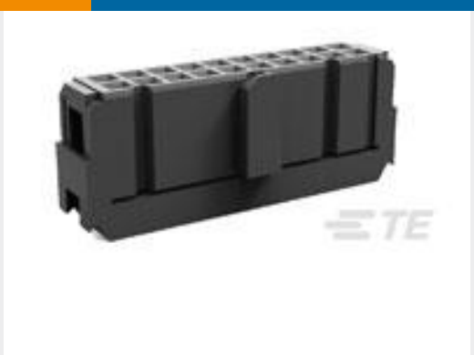
TE Part #1-1658621-2 64 NOVO MIL/CTR 15DP,LEAD FREE