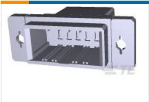
TE Part #178803-5 DYNAMIC D3100D TAB HSG PM 10P