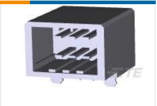
TE Part #178303-3 6-P POST HDR HORZ D-3100D .76