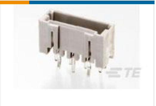
TE Part #2-292207-3 MINI CT SGL DIP V 3P BLACK