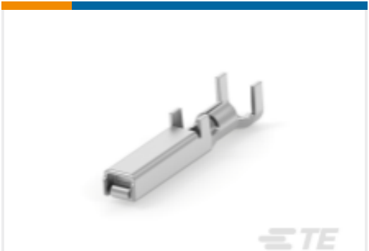
TE Part #175289-3 Contact: Component To Wire; 15A, 28-14 wire size