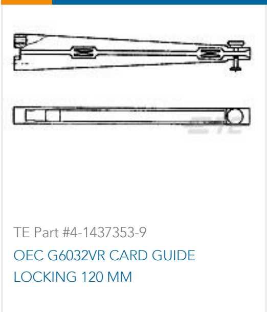
TE Part #4-1437353-9 OEC G6032VR CARD GUIDE LOCKING 120 MM