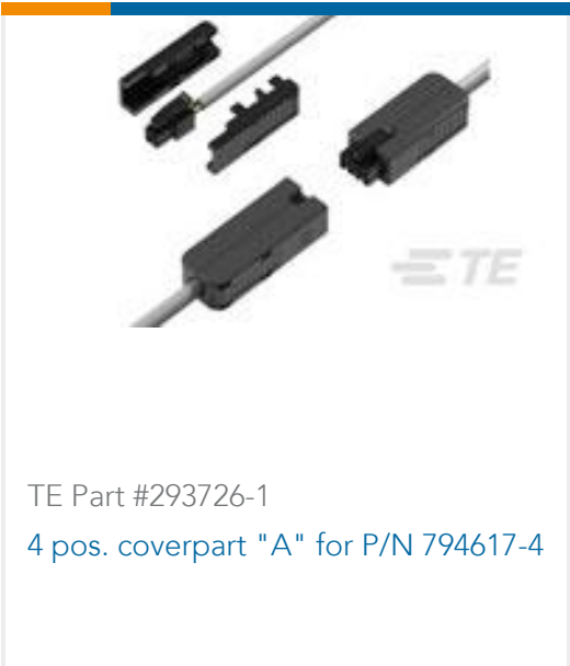
TE Part #293726-1 4 pos. coverpart "A" for P/N 794617-4