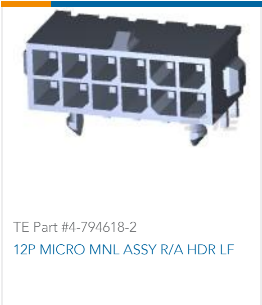
TE Part #4-794618-2 12P MICRO MNL ASSY R/A HDR LF