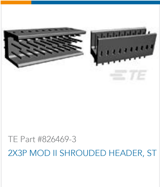
TE Part #826469-3 2X3P MOD II SHROUDED HEADER, ST