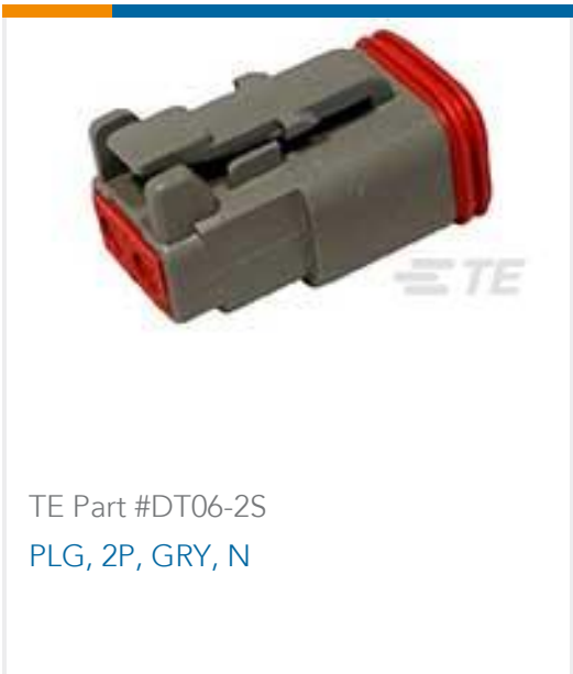
TE Part #DT06-2S PLG, 2P, GRY, N