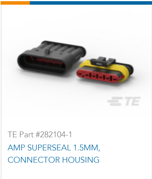
TE Part #282104-1 AMP SUPERSEAL 1.5MM, CONNECTOR HOUSING