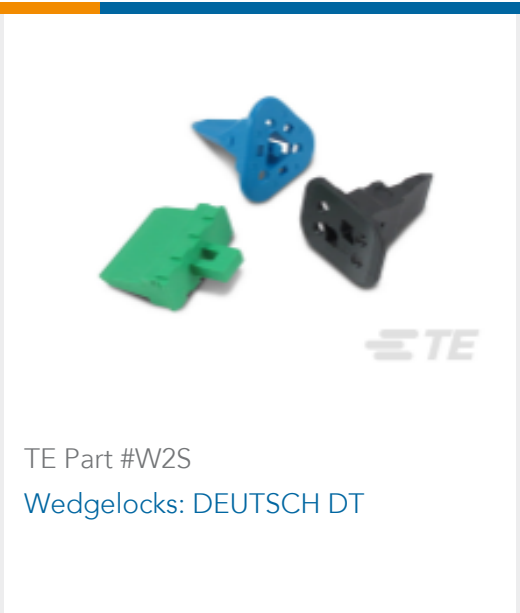
TE Part #W2S WedgeLocks: DEUTSCH DT