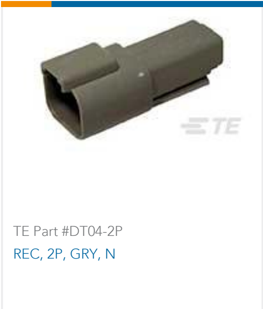
TE Part #DT04-2P REC, 2P, GRY, N