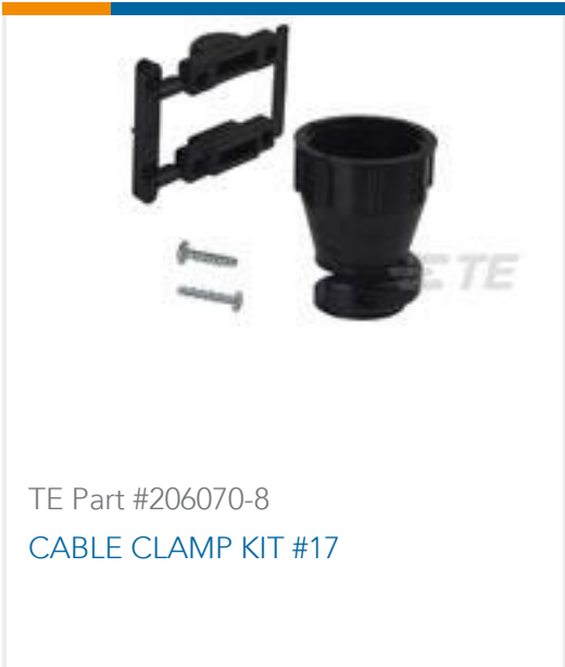
TE Part #206070-8 CABLE CLAMP KIT #17