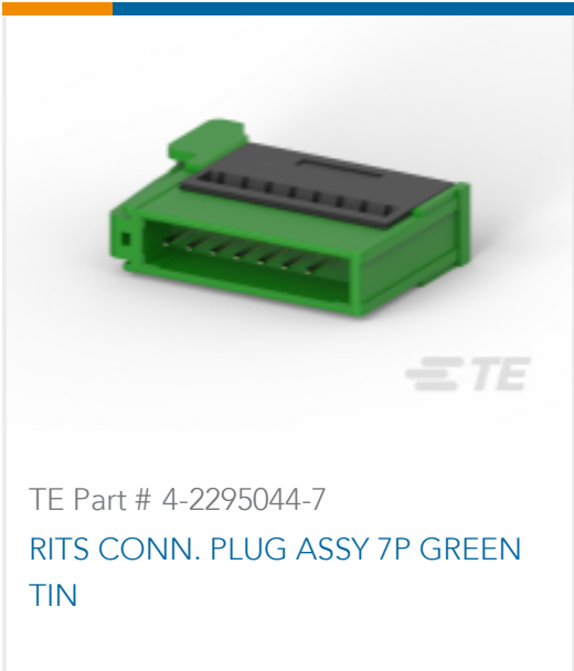
TE Part # 4-2295044-7 RITS CONN. PLUG ASSY 7P GREEN TIN