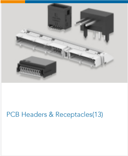
PCB Headers & Receptacles(13)