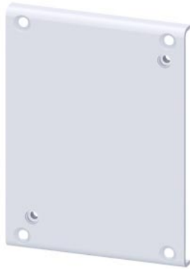
adapter plate for replacement of contactors 3TF52 / 3TK52 to SIRIUS 3RT1.5