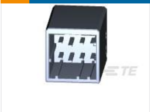
TE Part #1318125-1 DYNAMIC D2100 HDR V ASSY 8P