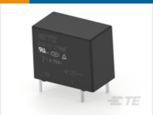
TE Part #2071556-5 OJS-SS-124HMF,00000