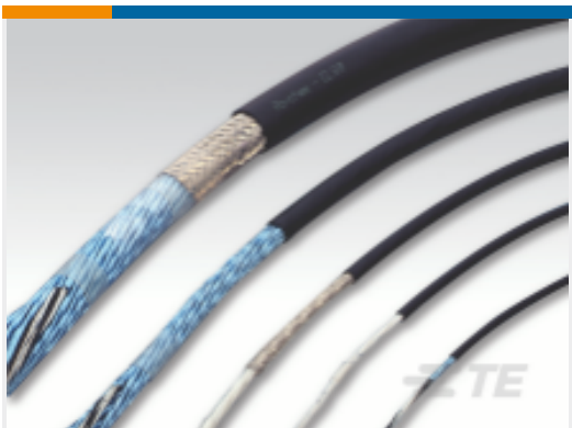
TE Part #CQ10333001 CL105-4X6.00-SO-0CK0456