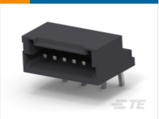
TE Part #2-292206-6 MINI CT SGL DIP H 6P BLACK