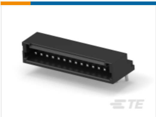
TE Part #3-292206-4 MINI CT SGL DIP H 14P BLACK