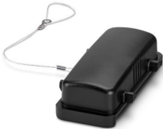
Protective cover B16, for double locking latch, protective cover material: PC, height: 26.4 mm, seal: no

Please be informed that the data shown in this PDF document is generated from our online catalog. Please find the complete data in the user documentation. Our general terms of use for downloads are valid.