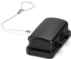
Protective cover B10, for double locking latch, protective cover material: PC, height: 26.3 mm, seal: no

Please be informed that the data shown in this PDF document is generated from our online catalog. Please find the complete data in the user documentation. Our general terms of use for downloads are valid.