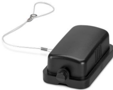
Protective cover B10, for single locking latch, protective cover material: PC, height: 26.3 mm, seal: no

Please be informed that the data shown in this PDF document is generated from our online catalog. Please find the complete data in the user documentation. Our general terms of use for downloads are valid.