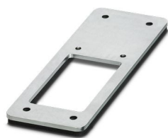
Adapter plate, design: B24 to B10

Please be informed that the data shown in this PDF document is generated from our online catalog. Please find the complete data in the user documentation. Our general terms of use for downloads are valid.