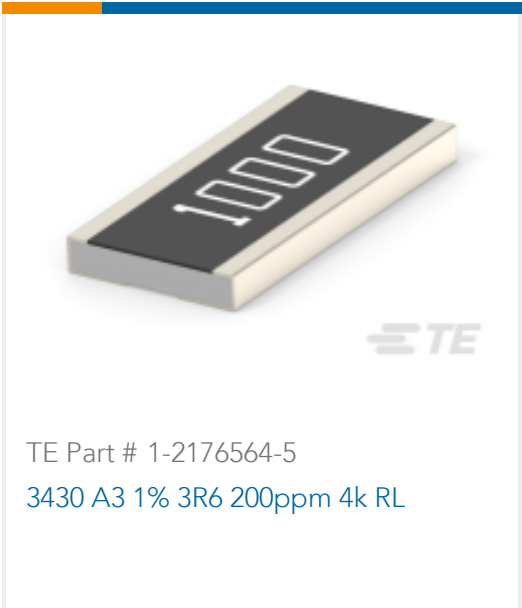
TE Part # 1-2176564-5 3430 A3 1% 3R6 200ppm 4k RL