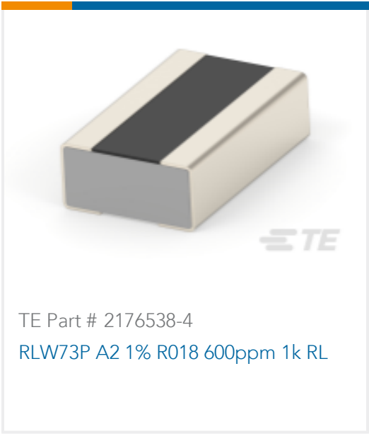
TE Part # 2176538-4 RLW73P A2 1% R018 600ppm 1k RL