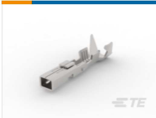
TE Part #2329914-1 Power Versa-Lock SEAL RECPT, 18-20 AWG