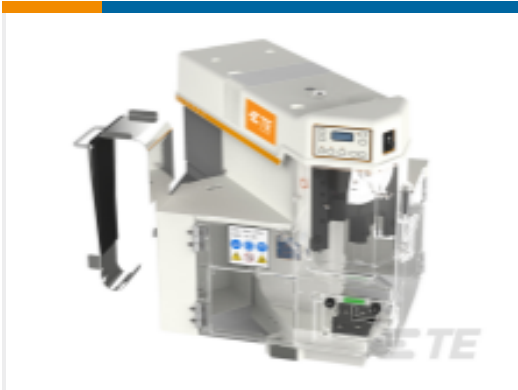
TE Part #2217000-2 MODEL G II CE TERMINATOR, W /COM