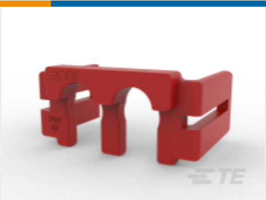
TE Part #2334614-2 Power Versa-Lock BACK COVER 2P