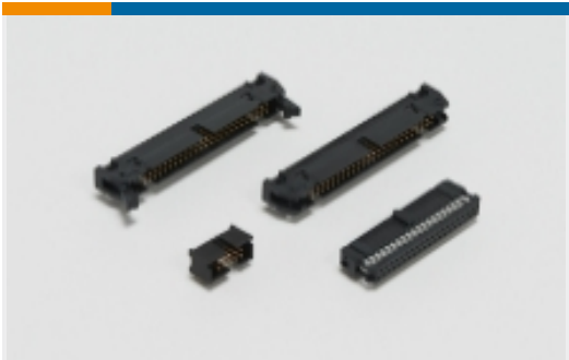
Ribbon Cable Connectors(525)