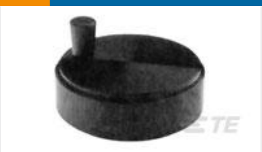
TE Part #4-1437622-1 KN1755BS1/4=KNOB KNURL W /SPINN