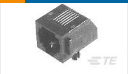
TE Part #5569026-1 MJ,LPF,R/A,6P,HTN