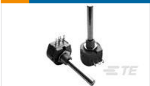
TE Part #1676979-4 TW 1W 10K 6.35X25PL