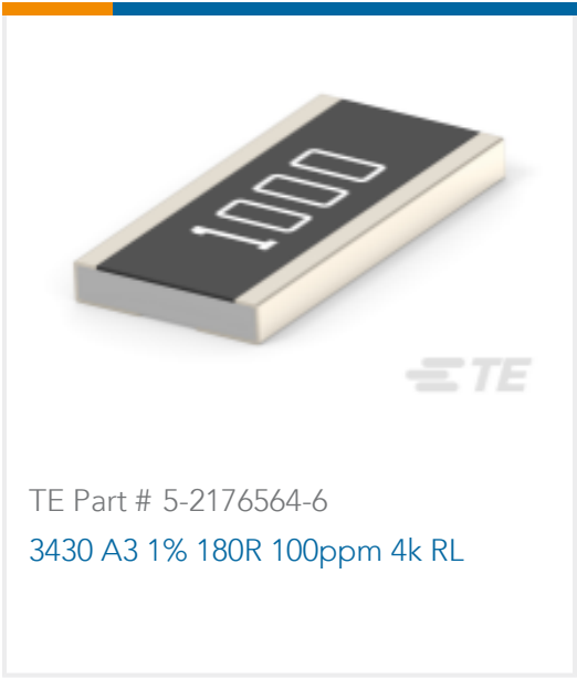
TE Part # 5-2176564-6 3430 A3 1% 180R 100ppm 4k RL