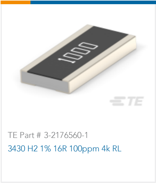
TE Part # 3-2176560-1 3430 H2 1% 16R 100ppm 4k RL