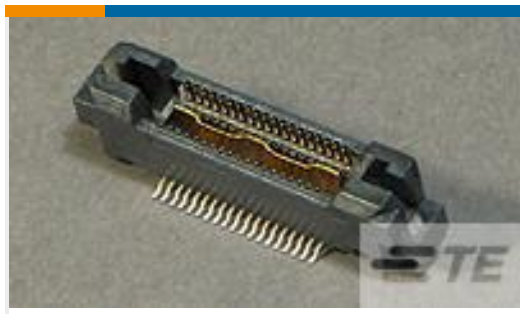
TE Part #5767056-1 MICT,260,PLUG,38,ASSY,PDNI