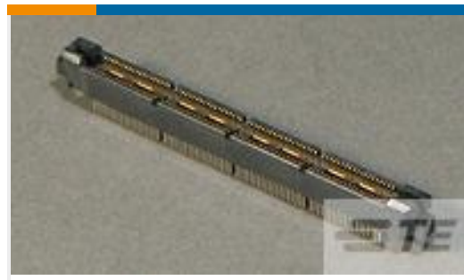
TE Part #5767006-4 MICT,R/APLUG,152,ASY,.025,.062