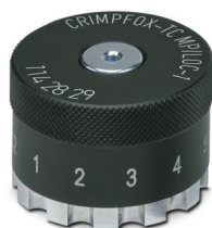
Locator for CRIMPFOX-TC MP6

https://www.phoenixcontact.com/us/products/1142829