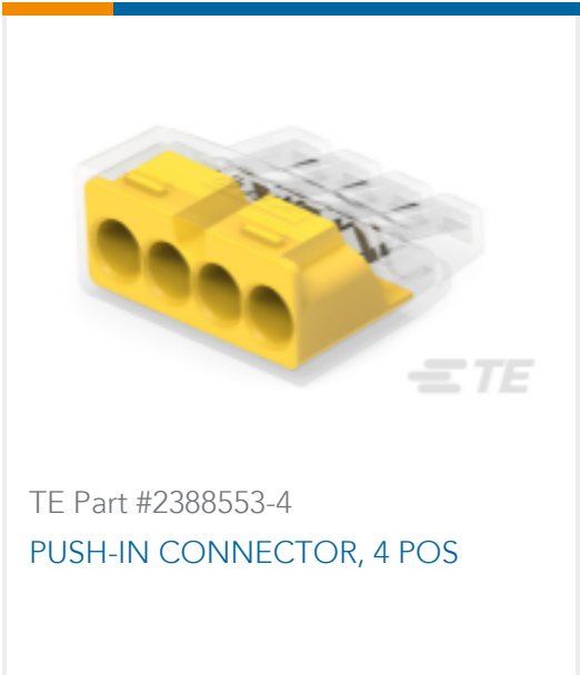
TE Part #2388553-4 PUSH-IN CONNECTOR, 4 POS