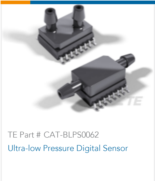
TE Part # CAT-BLPS0062 Ultra-low Pressure Digital Sensor