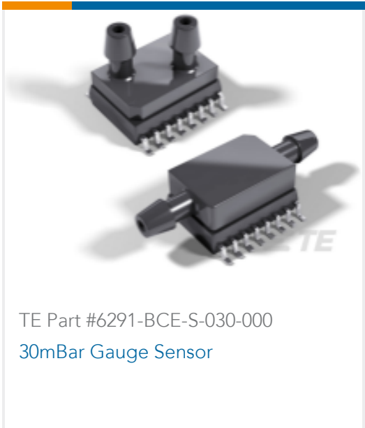
TE Part #6291-BCE-S-030-000 30mBar Gauge Sensor

ENG_CVM_CVM_9236-BCE-S-600-002_1.2d_dxf.zip