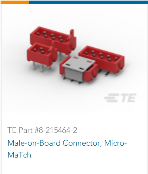
TE Part #8-215464-2 Male-on-Board Connector, Micro-MaTch