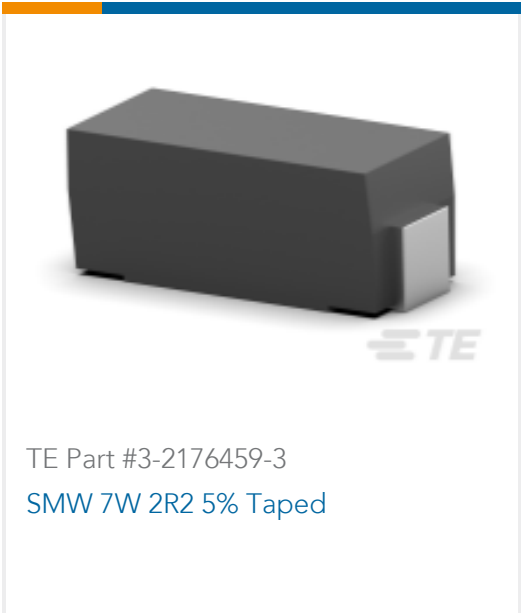
TE Part #3-2176459-3 SMW 7W 2R2 5% Taped