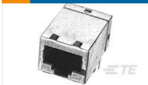
TE Part #100616-2 8/8 MOD.JACK ASSY TE SHIELDED