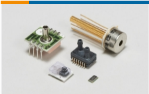
Board Mount Pressure Sensors(35)