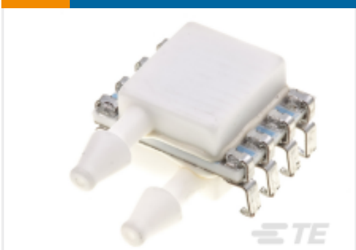
TE Part #4525DO-DS5AI001DP 1IN PCB MOUNT I2C DIFF PRESSURE SENSOR