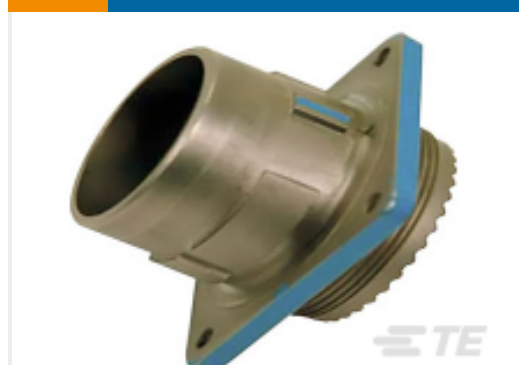
TE Part #YDIV46E13-35PNV001 PLUG ASSY