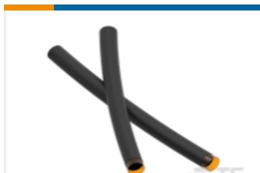
TE Part #NB17632001 TAT-125-1-1/2-0-STK