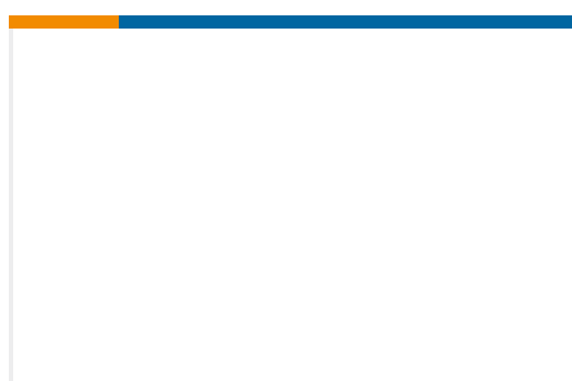
TE Part #361511-2 DWP-125-1/8-0-STK