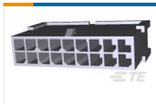
TE Part #1-794616-8 FREE HANG DBL ROW HSG 18 POS