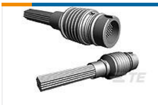
TE Part #1589693-1 QCM044PC2DC006B = CIRCULAR