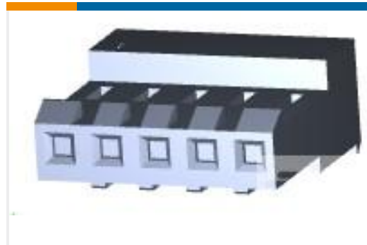
TE Part #3-640427-5 05P MTA156 CONN ASSY 20AWG YEL