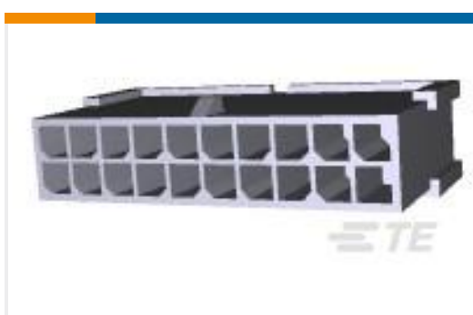
TE Part #2-794616-0 FREE HANG DBL ROW HSG 20 POS