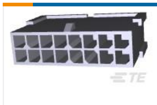
TE Part #1-794616-6 FREE HANG DBL ROW HSG 16 POS