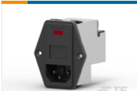
TE Part #6-6609930-8 PE000DHXB=C2382