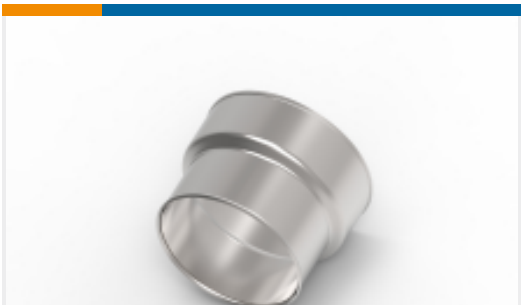
TE Part #1670813-1 EMC, CRIMP SLEEVE, IPT 70 - 12