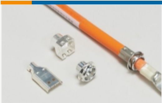
Automotive Connector EMC Shielding (2)