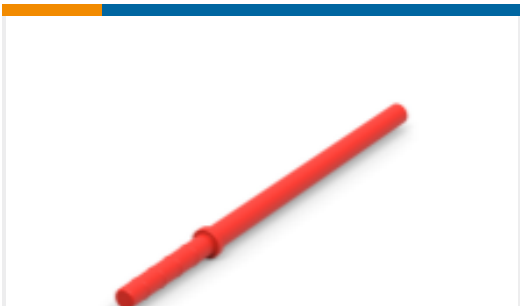
TE Part #0413-216-2005 SEALING PLUG, SIZE 20, KEYING, RED