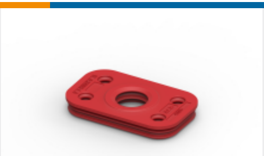
TE Part #2141612-4 RADIAL SEAL 25 X 43, CABLE SEAL,RD