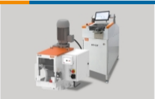
High Voltage Wire Processing Equipment(10)