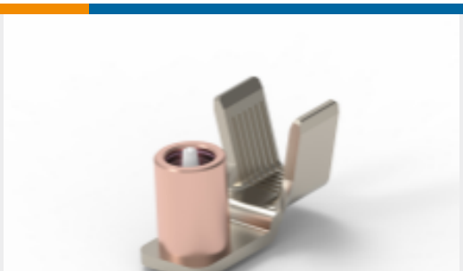
TE Part #2137715-3 11MM HV, TERMINAL ASSY 90DEG