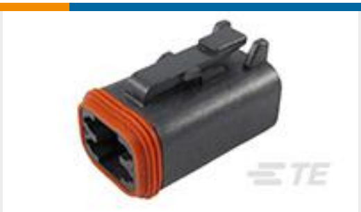
TE Part #DT06-4S-P012 PLG, 4P, BLK, N, SEAL RET