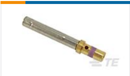
TE Part #0462-005-2031 SOC, SOLID, SIZE 20, 16-18AWG, AU