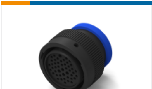
TE Part #HDP26-24-47SE-L017 PLG, 47P, BLK, E, RNG, 16/20, S