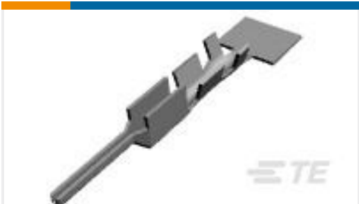
TE Part #1-794608-0 PIN CONT 20-24 TIN PLATE STRIP