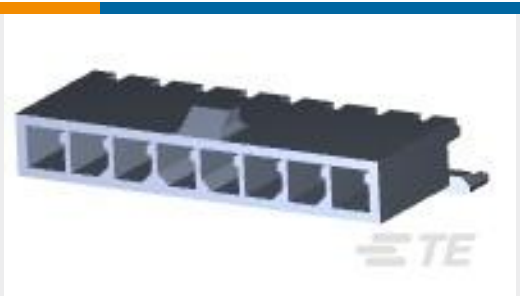
TE Part #2-1445050-8 MICRO MNL HDR ASSY S/ROW LF