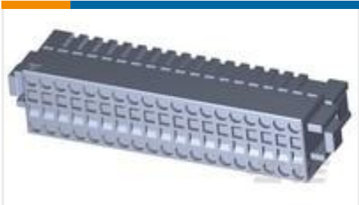
TE Part #2-1871940-9 DYNAMIC 1900D REC ASSY(SPR CLAMP) 38P