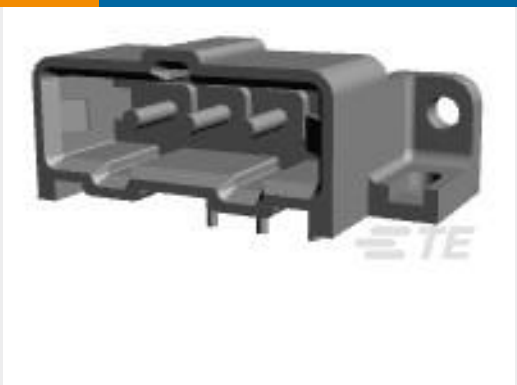
TE Part #207541-7 MMATE PIN HEADER ASSY,3P LF