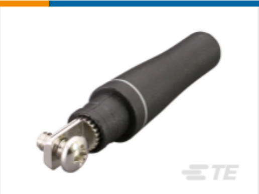
TE Part # ANT-868-PW-LP Antenna 1/4 Wave 868MHz Screw #10