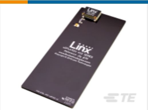
TE Part # AEK-868-USP410 Eval Kit uSP410 868MHz Antenna