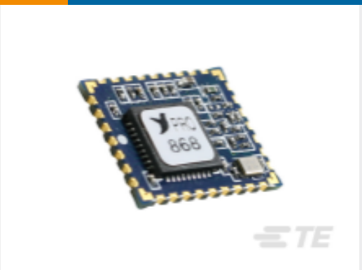
TE Part #HUM-868-PRO Module HUM-PRO 868MHz FHSS FM XCVR