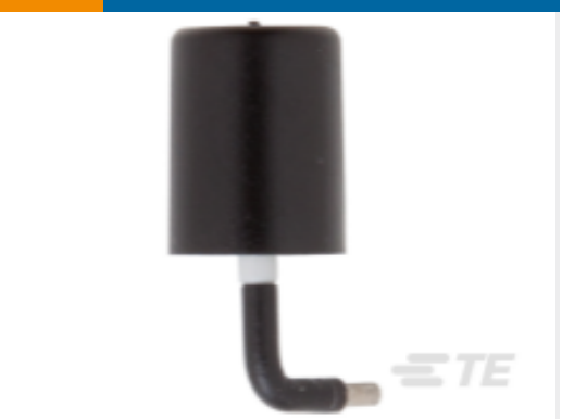
TE Part # ANT-868-JJB-RA Antenna Mini R-Angle 868MHz THM