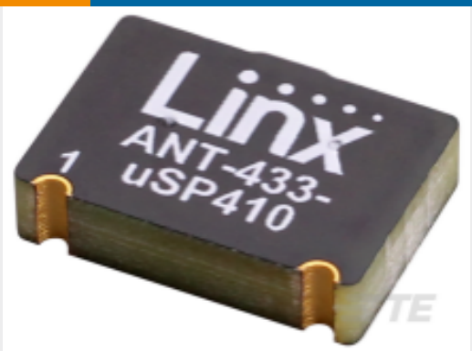
TE Part #ANT-433-USP410 Antenna uSP PCB RPC 410 433MHz SMT T&R