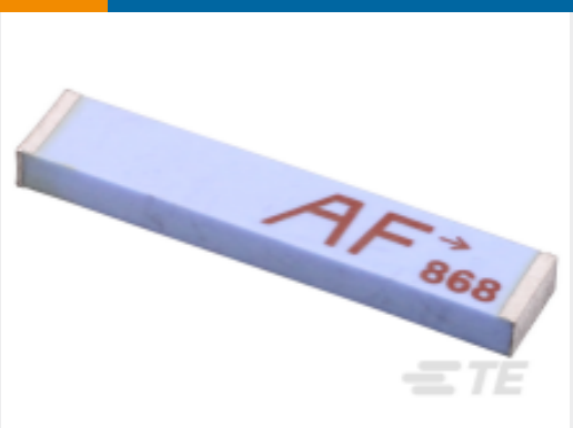
TE Part # ANT-868-CHP-T Antenna Chip T&R 868MHz SMT