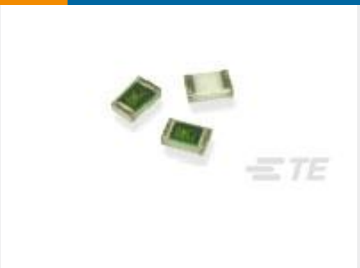
TE Part #1676346-2 RN 0805 464R 0.1% 10PPM 1KRL