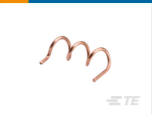
TE Part # ANT-868-HESM Antenna 1/4 Wave Coil 868MHz SMT