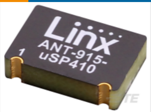
TE Part #ANT-915-USP410 Antenna uSP PCB RPC 410 915MHz SMT T&R