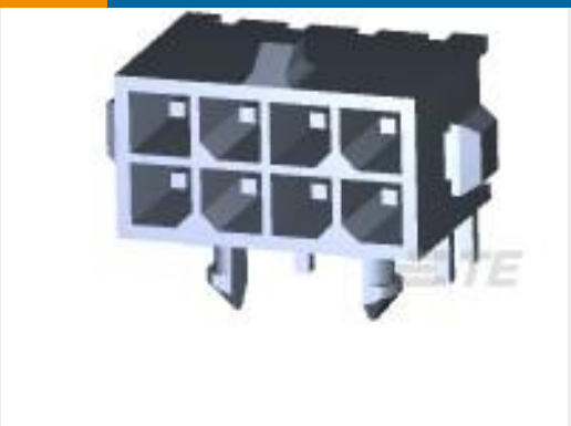
TE Part #3-794619-8 08P MICRO MNL ASSY,R/A,HDR LF