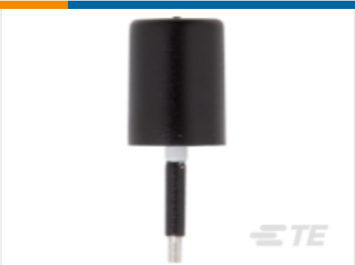
TE Part # ANT-868-JJB-ST Antenna Mini Straight 868MHz THM