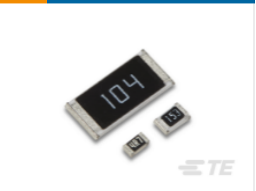
TE Part #4-2176345-2 CRGCQ 1210 27K 1%