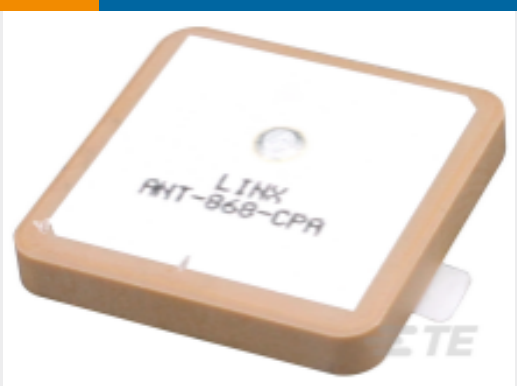
TE Part # ANT-868-CPA Antenna CER Patch 25mm Sq 868MHz Adh