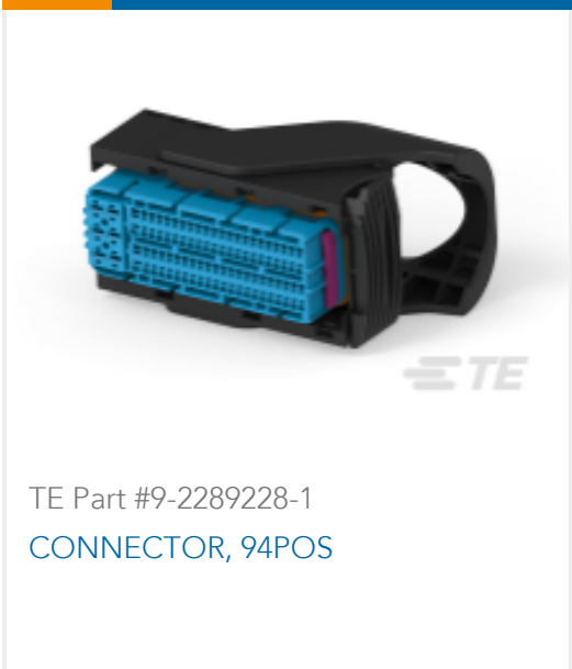
TE Part #9-2289228-1 CONNECTOR, 94POS