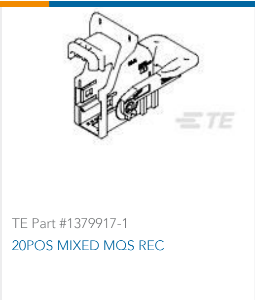
TE Part #1379917-1 20POS MIXED MQS REC