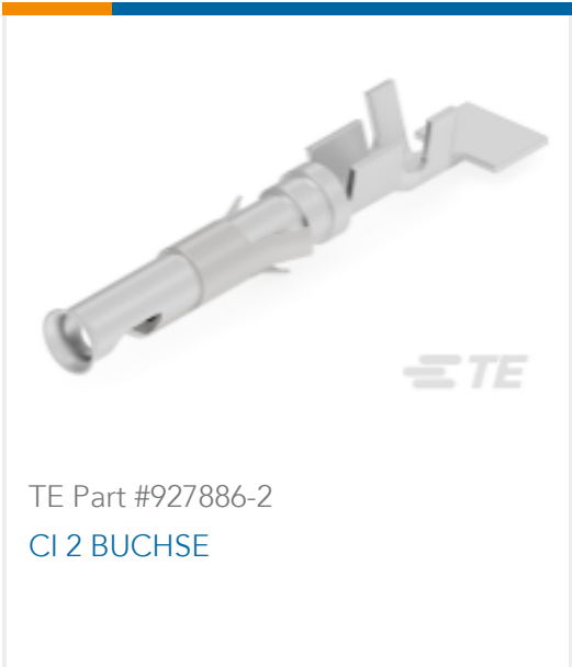
TE Part #927886-2 CI 2 BUCHSE