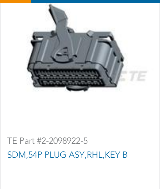
TE Part #2-2098922-5 SDM,54P PLUG ASY,RHL,KEY B