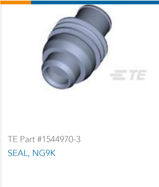
TE Part #1544970-3 SEAL, NG9K