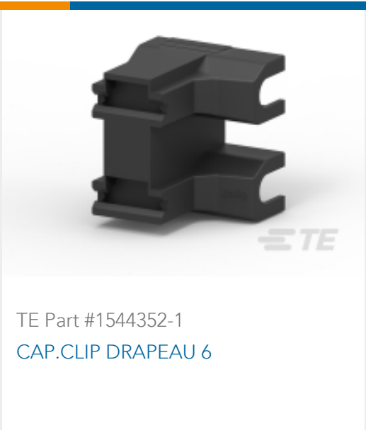
TE Part #1544352-1 CAP.CLIP DRAPEAU 6