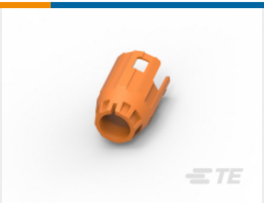
TE Part #2141159-1 FINGER PROT CAP 8MM HV,90DEG