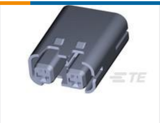
TE Part #1587985-1 INNER HSG SUBASSY, HVA280-2PHM