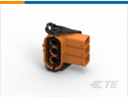
TE Part #1-2141166-1 3POS,8MM HV,REC HSG,90DEG,ASSY, SEALED