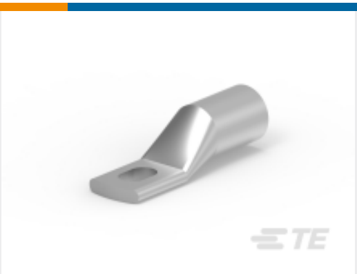
TE Part #1670815-1 RING TONGUE, IPT 70 - 120MM?