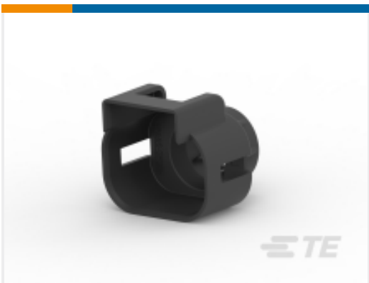
TE Part #2103013-2 CABLE SEAL RETAINER, SIZE 2, BK, HVA280