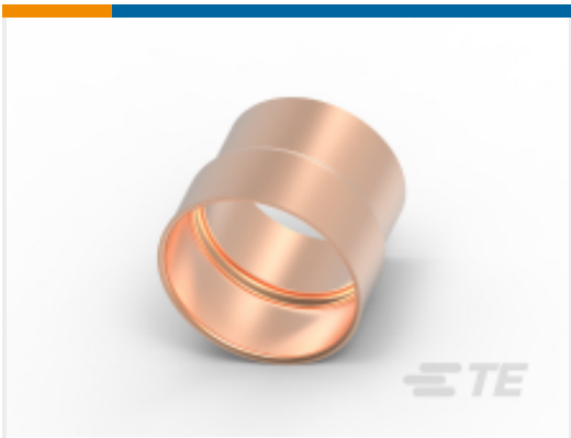
TE Part #9-2141157-1 SHIELD CRIMP FERRULE,90DEG