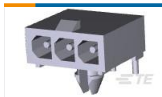
TE Part #1-770967-1 03P MINI UMNL R/A HDR ASSY AU