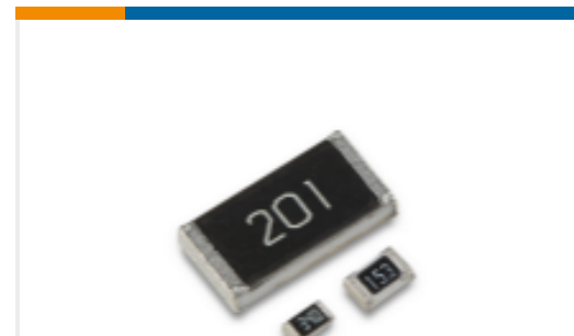
TE Part #5-2176330-3 CRGP 2010 220K 1%