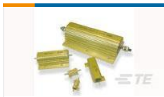
TE Part #3-1630019-2 HSC200 2R7 5%