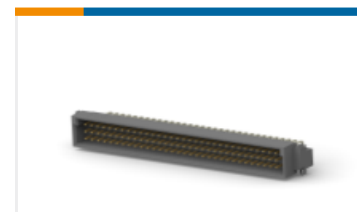
TE Part #650913-5 096 EURO TYPE C PIN BL ASSY