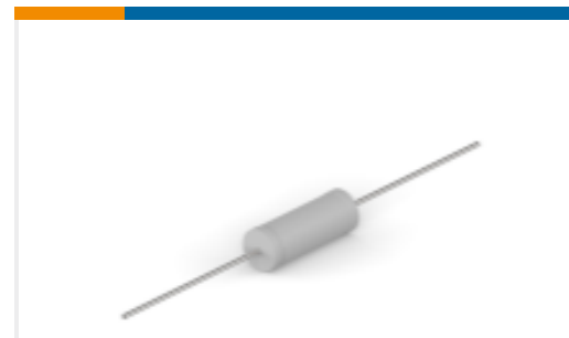
TE Part #3-2176412-7 5W XSM M/OX 5% 160R