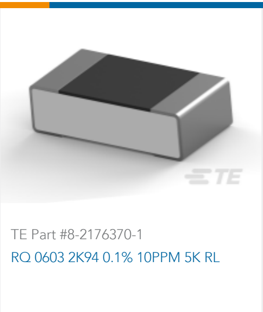
TE Part #8-2176370-1 RQ 0603 2K94 0.1% 10PPM 5K RL