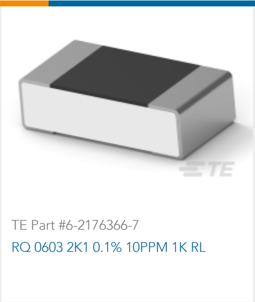
TE Part #6-2176366-7 RQ 0603 2K1 0.1% 10PPM 1K RL