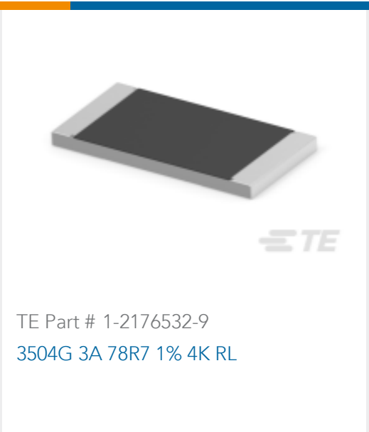
TE Part # 1-2176532-9 3504G 3A 78R7 1% 4K RL