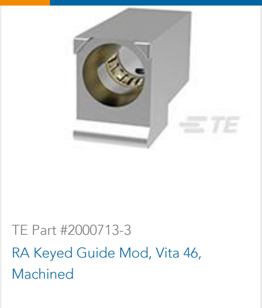
TE Part #2000713-3 RA Keyed Guide Mod, Vita 46, Machined