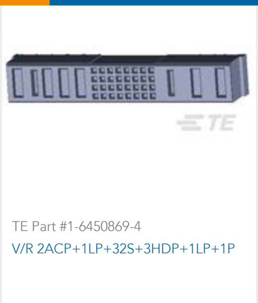
TE Part #1-6450869-4 V/R 2ACP+1LP+32S+3HDP+1LP+1P