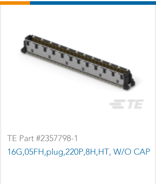
TE Part #2357798-1 16G,05FH,plug,220P,8H,HT, W/O CAP