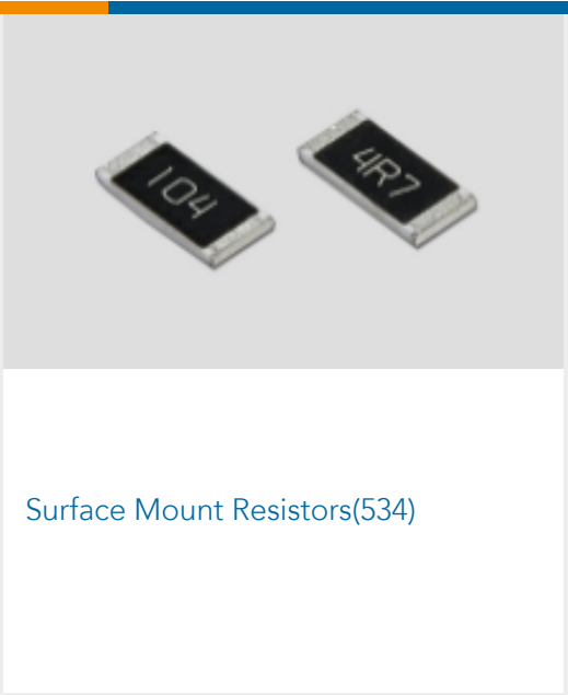
Surface Mount Resistors(534)