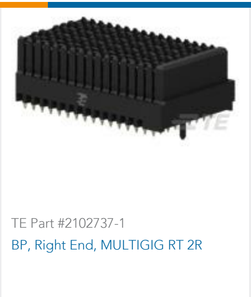
TE Part #2102737-1 BP, Right End, MULTIGIG RT 2R