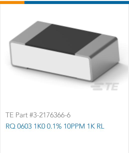
TE Part #3-2176366-6 RQ 0603 1K0 0.1% 10PPM 1K RL