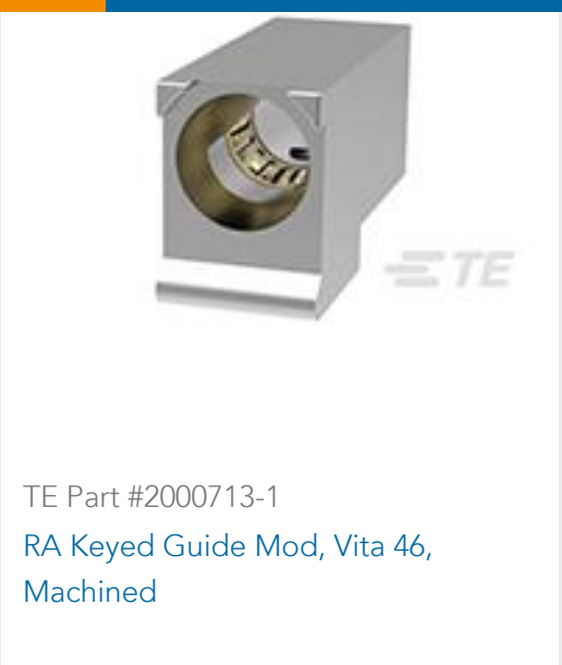
TE Part #2000713-1 RA Keyed Guide Mod, Vita 46, Machined