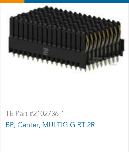
TE Part #2102736-1 BP, Center, MULTIGIG RT 2R