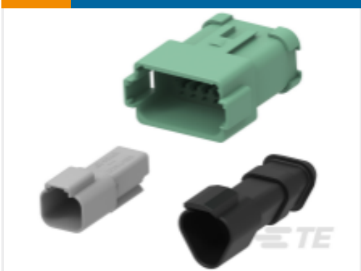
TE Part #DT04-08PB-L012 DEUTSCH DT Receptacle Connectors