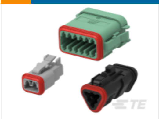
TE Part #DT06-12SA-CE12 DEUTSCH DT Plug Connectors