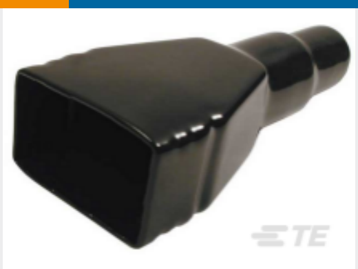
TE Part #DRC24-BT BOOT, 24P, 16SZ, PLG/REC, ST, BLK