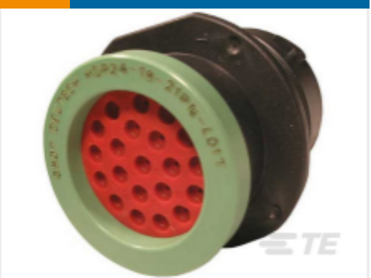
TE Part #HDP24-18-21PN-L017 REC, 21P, BLK, N, RNG, 20, P