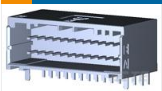
TE Part #1-1939638-3 DYNAMIC 1100D HDR ASSY H 26P XBLACK GOLD