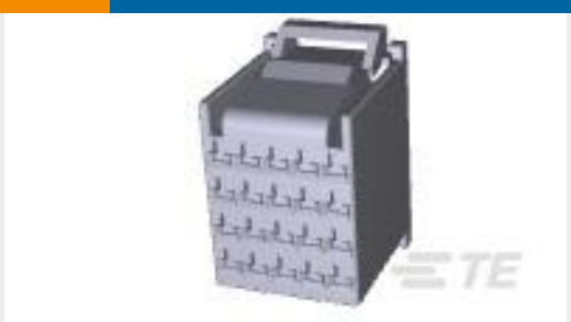
TE Part #917249-1 DYNAMIC D-3400F REC HSG 20P