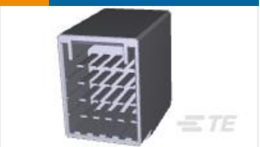
TE Part #917251-3 DYNAMIC D-3400F HDR ASSY 20P H