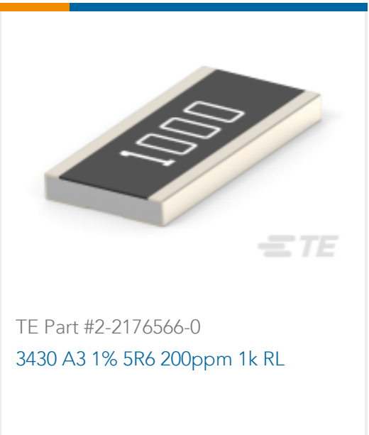
TE Part #2-2176566-0 3430 A3 1% 5R6 200ppm 1k RL