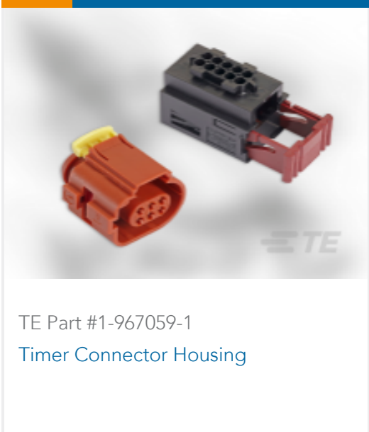
TE Part #1-967059-1 Timer Connector Housing