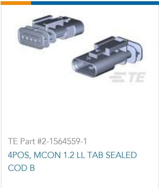
TE Part #2-1564559-1 4POS, MCON 1.2 LL TAB SEALED COD B