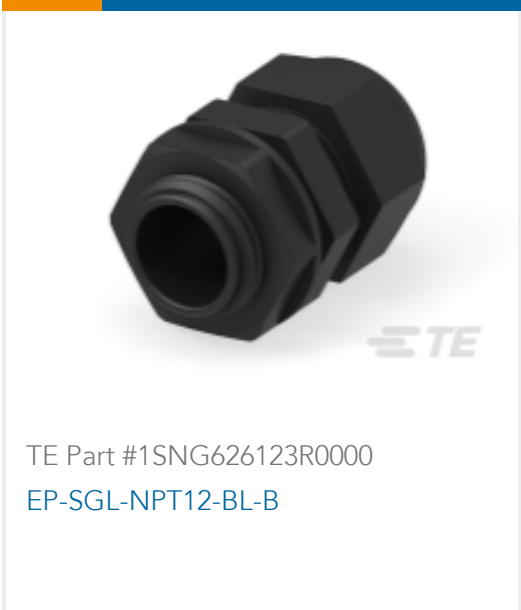
TE Part #1SNG626123R0000 EP-SGL-NPT12-BL-B