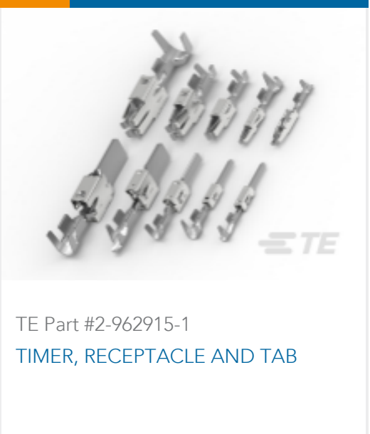
TE Part #2-962915-1 TIMER, RECEPTACLE AND TAB