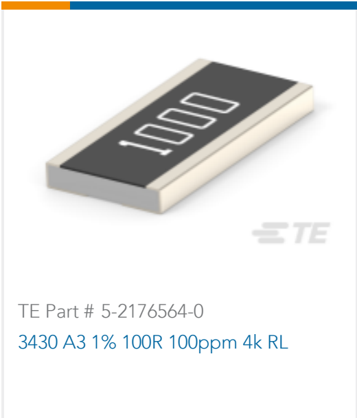
TE Part # 5-2176564-0 3430 A3 1% 100R 100ppm 4k RL