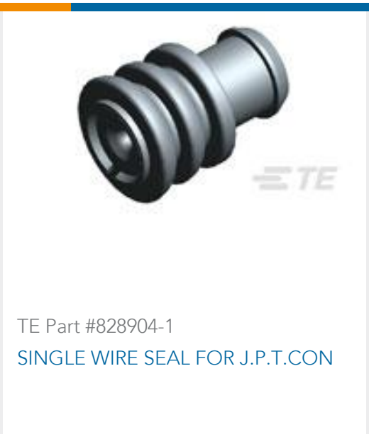
TE Part #828904-1 SINGLE WIRE SEAL FOR J.P.T.CON