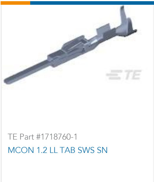
TE Part #1718760-1 MCON 1.2 LL TAB SWS SN