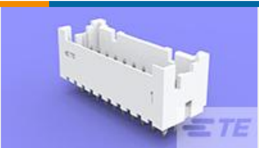
TE Part #1-1969582-0 ASSY, HDR, VERT, NO-BOSS, DUAL ROW,EP2.5