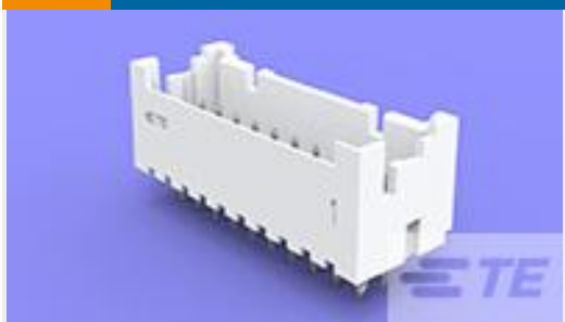
TE Part #1-1969582-6 ASSY, HDR, VERT, NO-BOSS, DUAL ROW,EP2.5