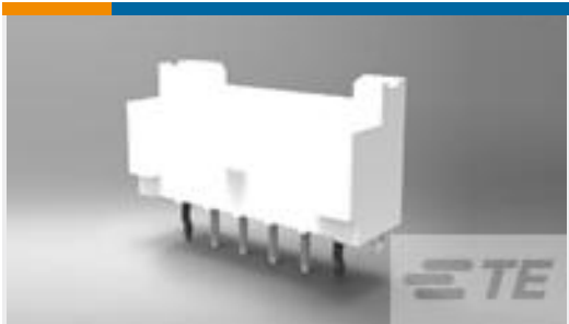
TE Part #2132415-4 EP2.5 Shrouded HDR ASSY 4P VERT w /o boss