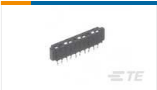
TE Part #5-520315-4 TRIOMATE ASSY V 4P L=3.556LDFR