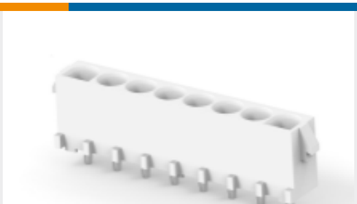
TE Part #826844-7 UMNL PC PIN HEADER 8POS