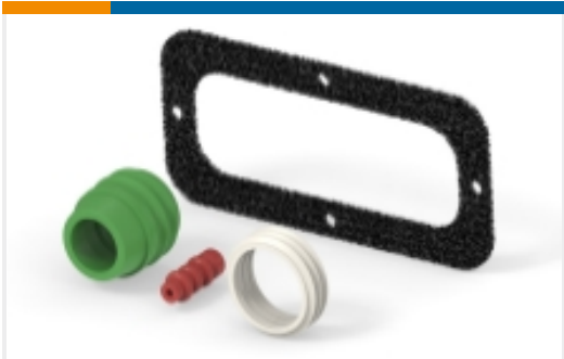
Connector Seals & Cavity Plugs(27)