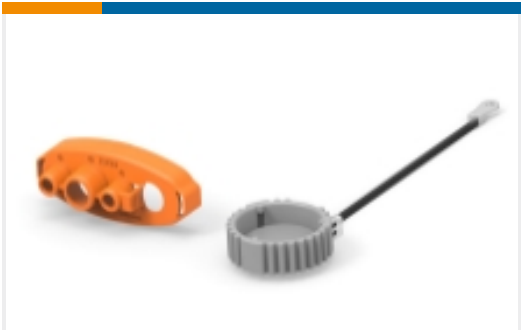
Connector Caps & Covers(34)