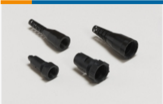
Connector Strain Relief(7)