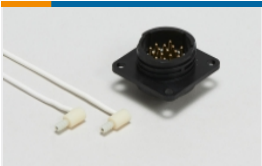
Circular Power Connectors(2)