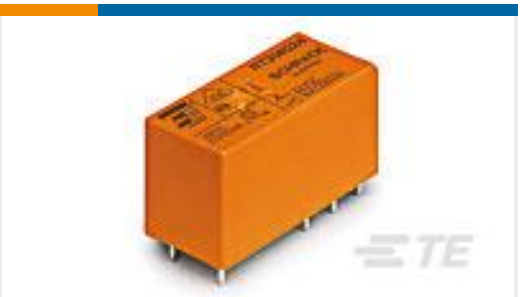
TE Part #1649328-6 RTD14024