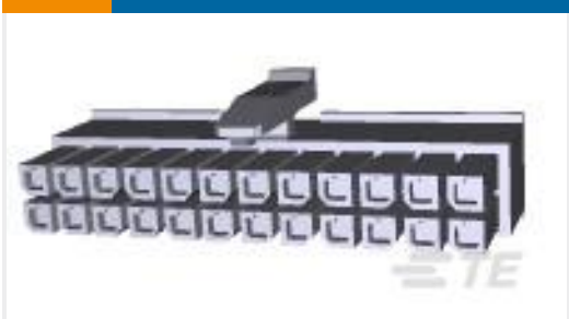
TE Part #2-794617-4 24POS,MICRO MNL,RCPT HSG