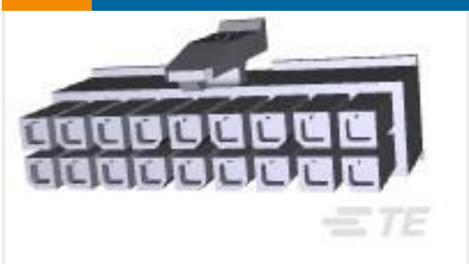
TE Part #1-794617-8 18POS,MICRO MNL,RCPT HSG