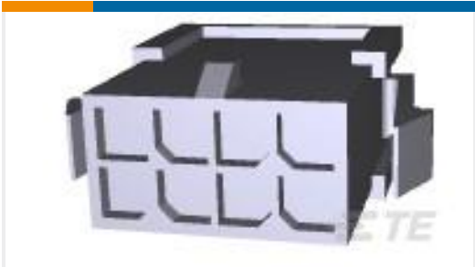
TE Part #794615-8 PANEL MT DBL ROW HSG 8 POS