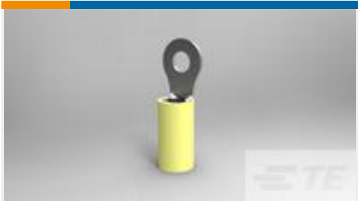
TE Part #54311-1 TERMINAL,PIDG R 26-24 8