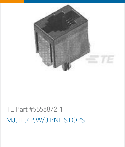
TE Part #5558872-1 MJ,TE,4P,W/O PNL STOPS