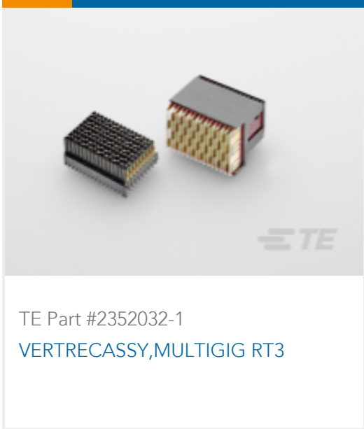
TE Part #2352032-1 VERTRECCASSY,MULTIGIG RT3