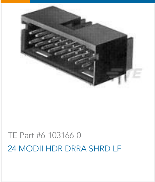
TE Part #6-103166-0 24 MODII HDR DRRA SHRD LF