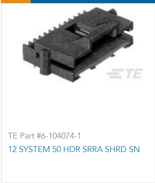
TE Part #6-104074-1 12 SYSTEM 50 HDR SRRA SHRD SN