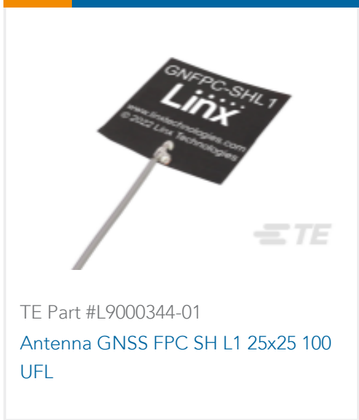
TE Part #L9000344-01 Antenna GNSS FPC SH L1 25x25 100 UFL