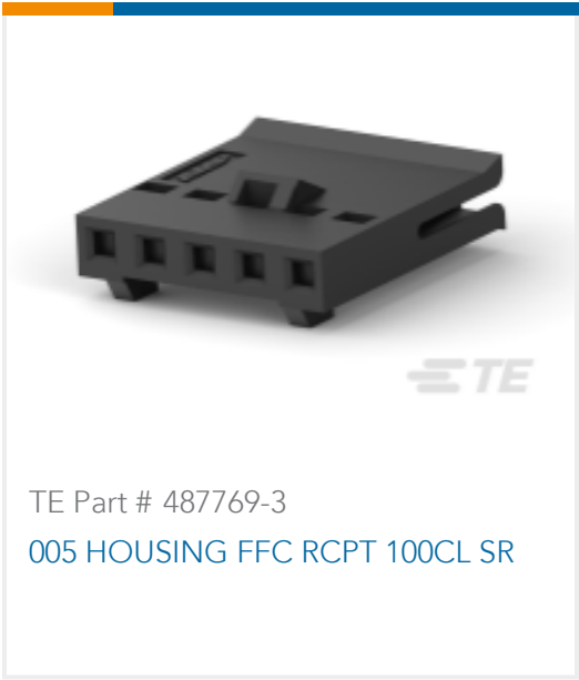
TE Part # 487769-3 005 HOUSING FFC RCPT 100CL SR