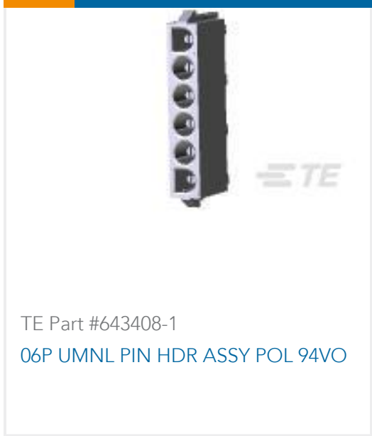
TE Part #643408-1 06P UMNL PIN HDR ASSY POL 94VO