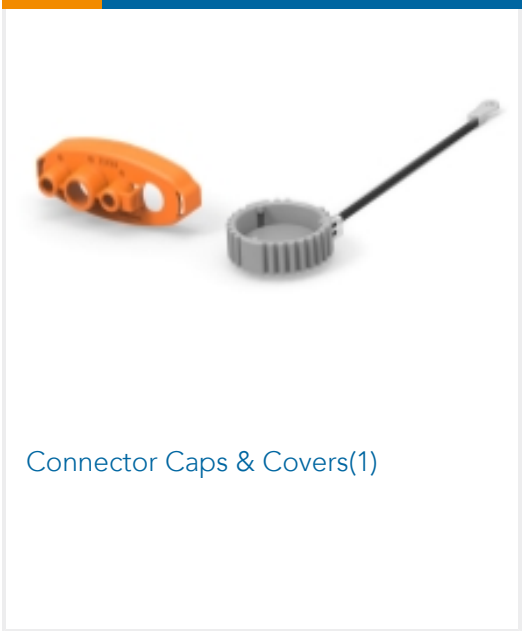
Connector Caps & Covers(1)