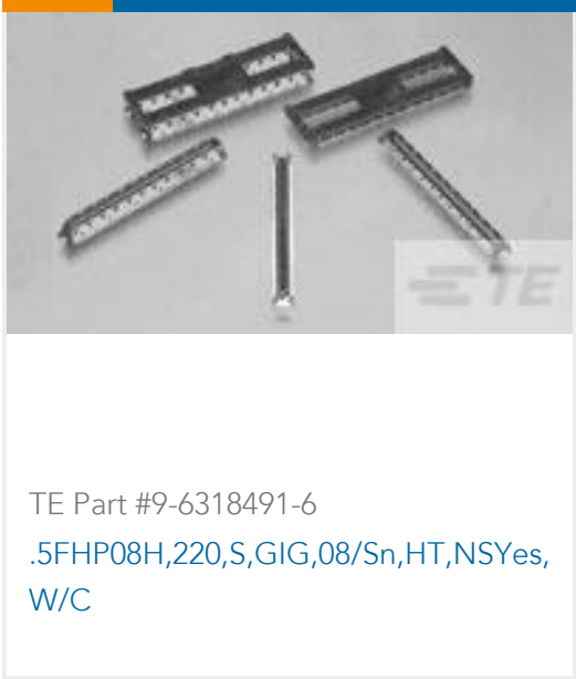
TE Part #9-6318491-6 .5FHP08H,220,S,GIG,08/Sn,HT,NSYes, W/C