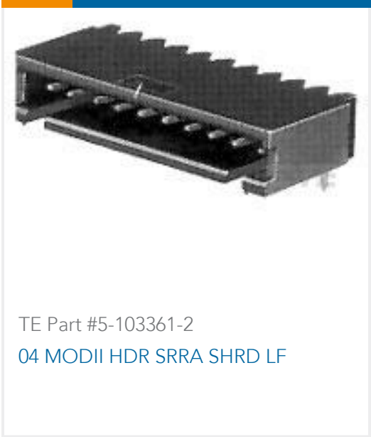
TE Part #5-103361-2 04 MODII HDR SRRA SHRD LF