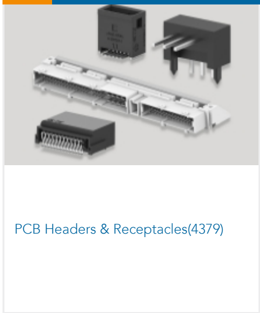
PCB Headers & Receptacles(4379)