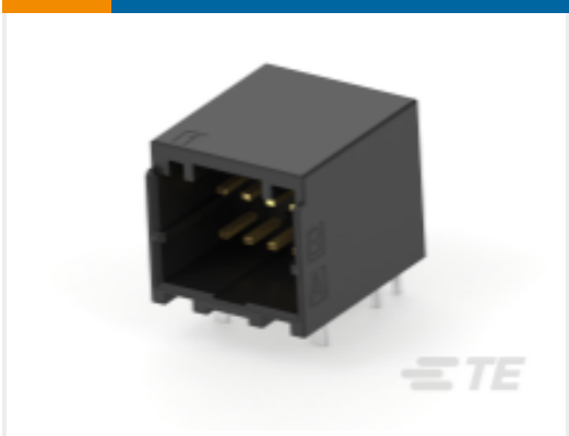
TE Part #1-1827872-1 Header Assembly: Wire-to-Board, 3A, Gold or Tin Plated