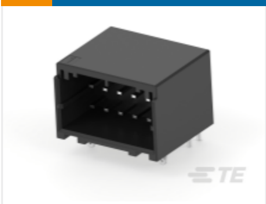
TE Part #1-1827876-4 Header Assembly: Wire-to-Board, 5A, gold or tin plated