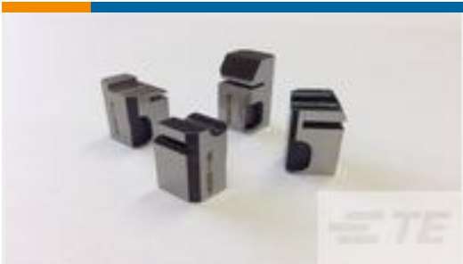
TE Part #1-318707-1 FLOATING SHEAR