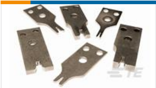
TE Part #3-1583690-0 CRIMPER, INSULATION "O"(.165")