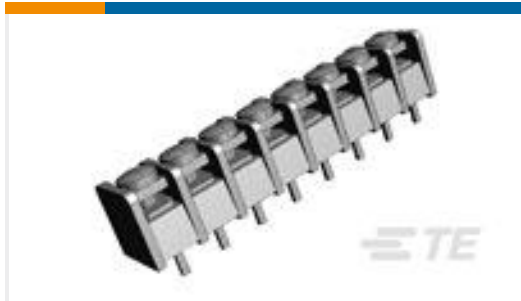
TE Part #3-1437667-1 4DB-P108-08=4DB ASSEMBLY