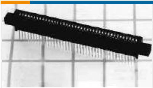
TE Part #1-5530841-8 CONN SEC II 30 POS 100C/L