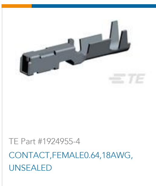
TE Part #1924955-4 CONTACT,FEMALE0.64,18AWG, UNSEALED