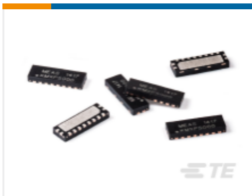
TE Part #G-MRCO-052 AMR Position Sensors