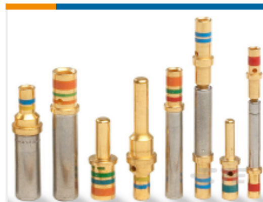
TE Part #2562-201-2031L CONT SOC ASSY