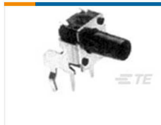
TE Part #1-1825027-1 FSMRA4JH04=R/A,TACT PB SW,160G